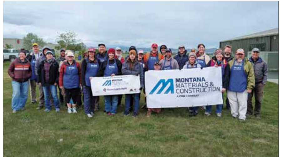
2026 SponCon Participants.

Then in June, creations were made available for purchase at the ReStore, with proceeds from their sale going to support the work of Helena Habitat and