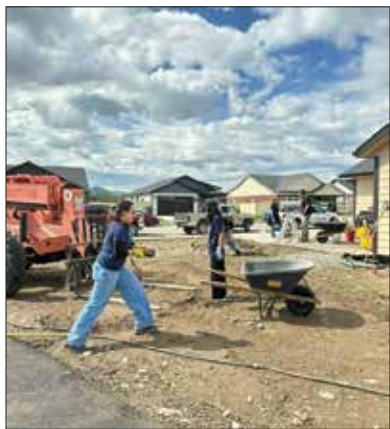
Staff from Montana Legal Services Association prepare yards for landscaping.

We had the pleasure of hosting the team from Montana Legal