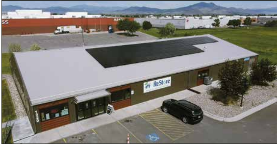
Solar array on the roof of the ReStore building.