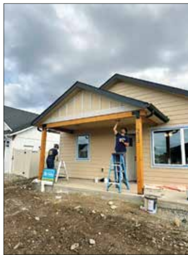
Staff from Montana Legal Services Association put final touches on the porch of a home.

As a part of their annual “All Staff Meeting” the MLSA team spends time giving back to their community. More than 40 MLSA employees chose to spend the day with Helena Habitat. Because of their hard work, we were able to move these homes one step closer to the finish line, helping prepare them for landscaping and for the upcoming home dedications in just a few short weeks. Every task completed brings us closer