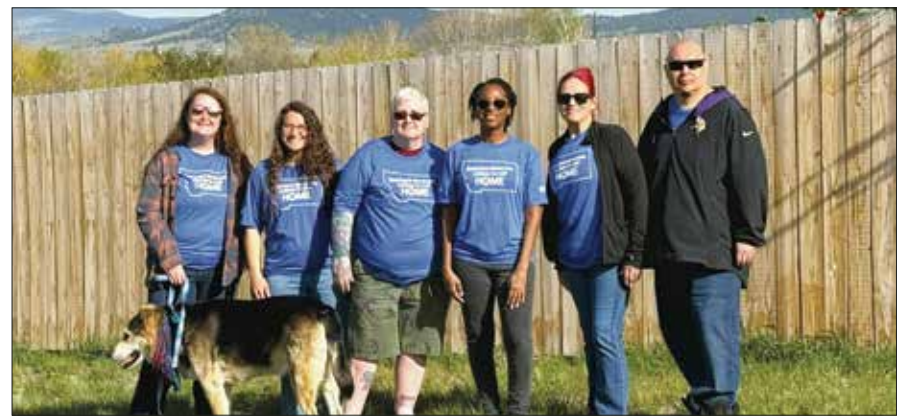
Five new families partnered with Helena Habitat to begin building their homes in June.