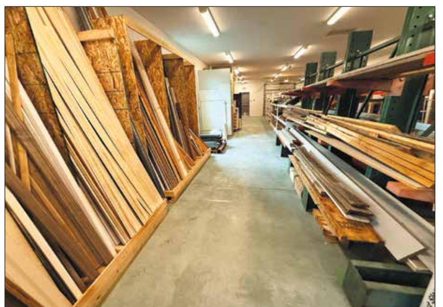
The barn is stocked and ready with reclaimed lumber and building materials