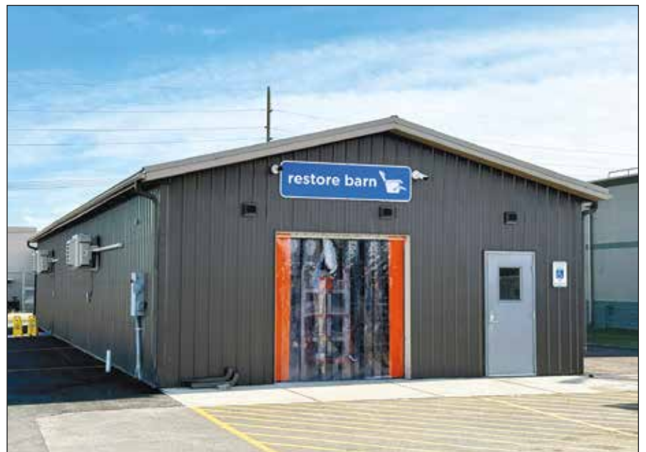
The new ReStore Barn is open! With more space than ever, bring in your spring cleaning donations and help us fill it up!