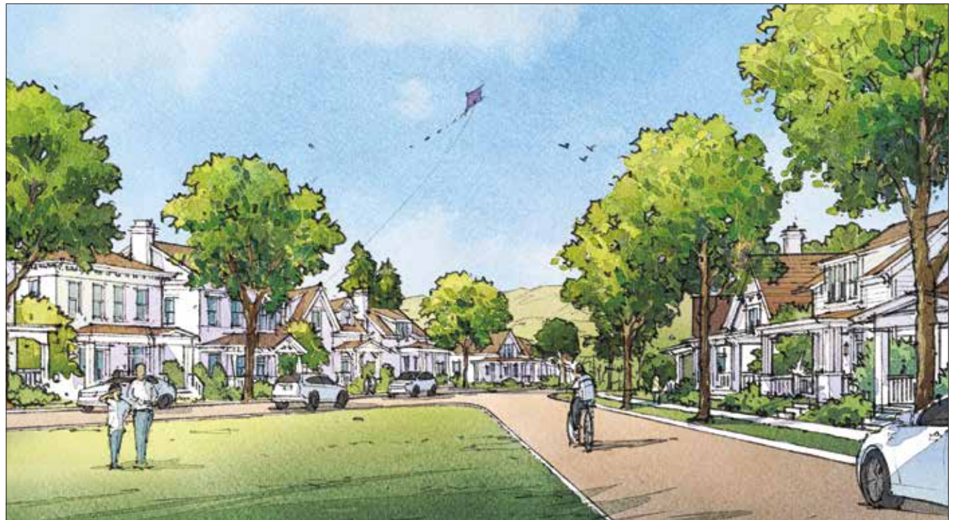
Artist's conceptual drawing of a street in the new neighborhood.

On November 22nd, we will host Charles Marohn, author of Escaping the Housing Trap , on a