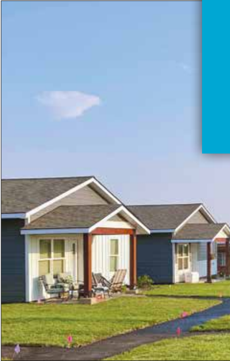
Red Lodge Park neighborhood

Helena Area Habitat for Humanity would like to thank the community of Red Lodge, the amazing local volunteers who contributed over 8,000 hours of labor, and our incredible partners who made it possible to build 14 permanently affordable homes.