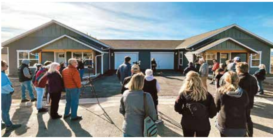
The April 27th dedication was attended by close to 70 people.