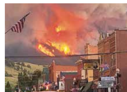
The 2021 Robertson Draw fire caused widespread local evacuations.

The dedication of local volunteers and staff from the Red Lodge Area Community Foundation has been truly inspiring.