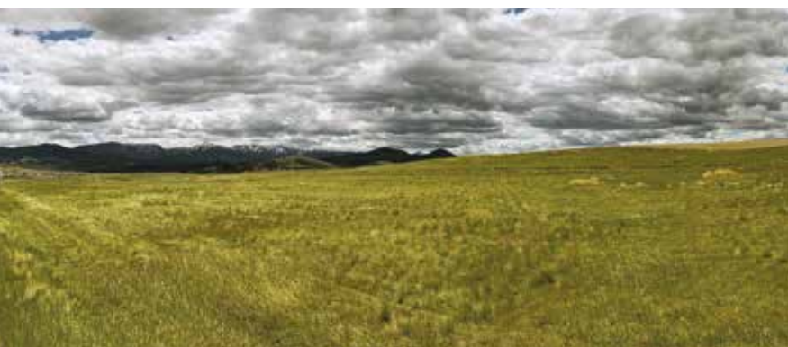
The transformation of this hillside will take many years, but someday soon this will be the site of a brand-new neighborhood, and a wonderful addition to our community.