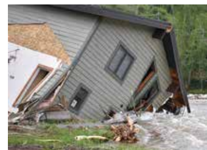
Much of downtown Red Lodge was devastated by the historic flooding in June of 2022.