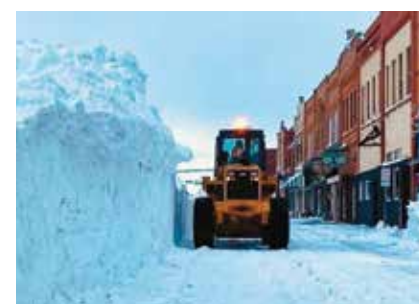
2023 saw record levels of snowfall in Red Lodge, with nearly four feet recorded over a two-day period at the end of March.