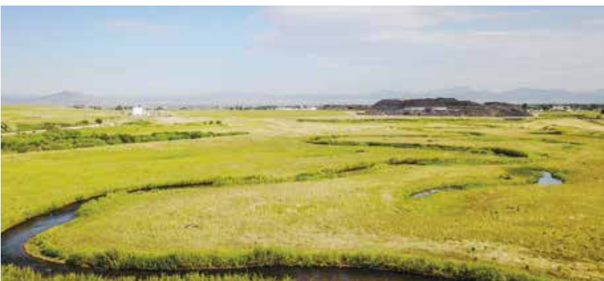
On an adjacent property Prickly Pear Land Trust (PPLT) has worked hard over the past few years on an exciting greenspace reclamation project.

you to thoughtfully consider an investment in Helena Area Habitat for Humanity and the working families of our community; of those we currently serve, and of those to come.