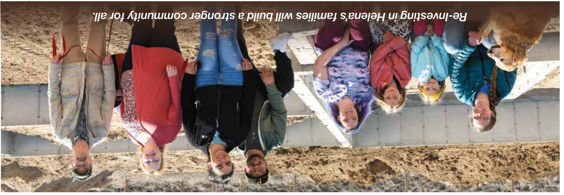
Re-investing in Helena's families will build a stronger community for all.