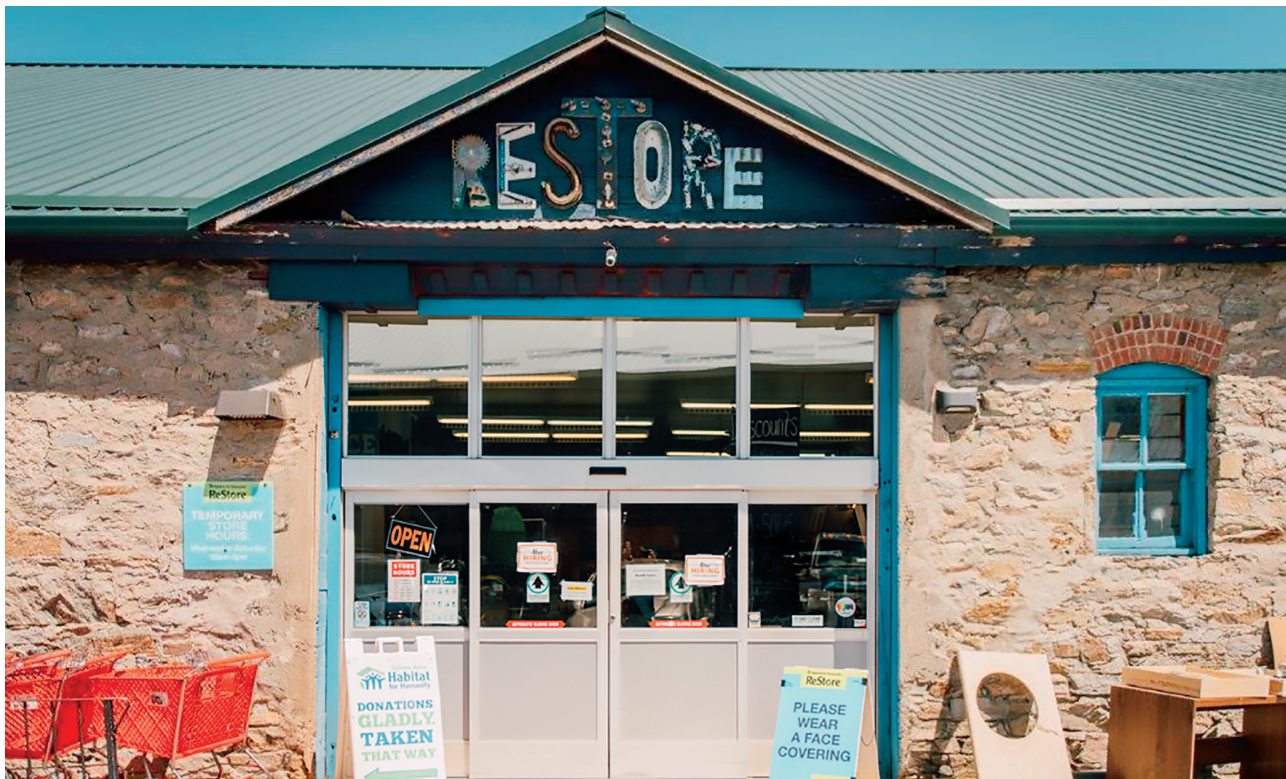
There's something for everyone at the Helena Habitat ReStore.

To schedule a pickup call: (406) 204-7307.