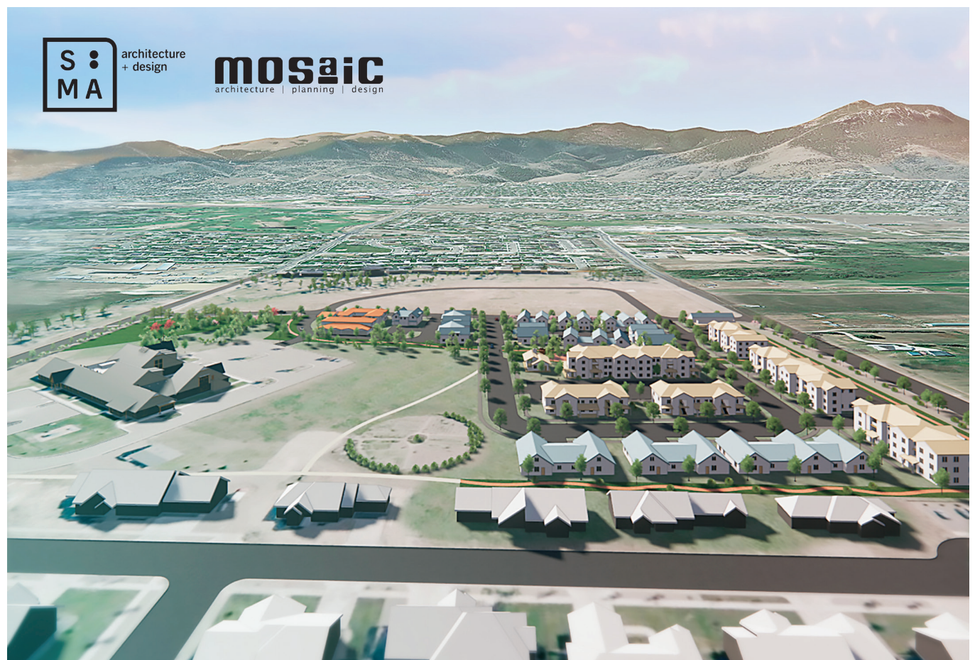
Architect's rendering of the proposed project. (Photo courtesy of Mosaic Architecture and SMA Architecture and Design.)

In January it was announced that Helena Habitat is partnering with Our Redeemer's Lutheran Church to build at least 30 homes for local families. Rocky Mountain Development Council and the YWCA will also build homes for their clients for a total of 130 affordable homes. As part of the project, the city of Helena is considering allocating upwards of $2.4 million in ARPA (American Rescue Plan Act) funds for the project. We encourage you to reach out to the city commission to voice your support for this important and timely project.