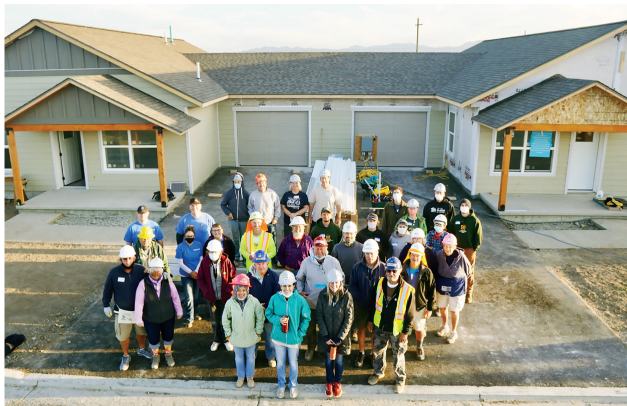
Future homeowners and volunteers come together to build safe and affordable housing at Red Fox Meadows in East Helena.

the keys to the new owners. Your belief that everyone deserves a safe and affordable place to live helped these and other homes to grow from a dusty plot of land to a wonderful place to live.