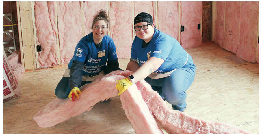
Sweat equity is part of what makes Habitat homes affordable.

families sign up for an affordable mortgage at a low interest rate. No down payment is required other than the sweat equity they each commit in building their homes and the homes of their neighbors. The home appreciates, of course, but the appreciation is capped at 1.5% per year, ensuring the home